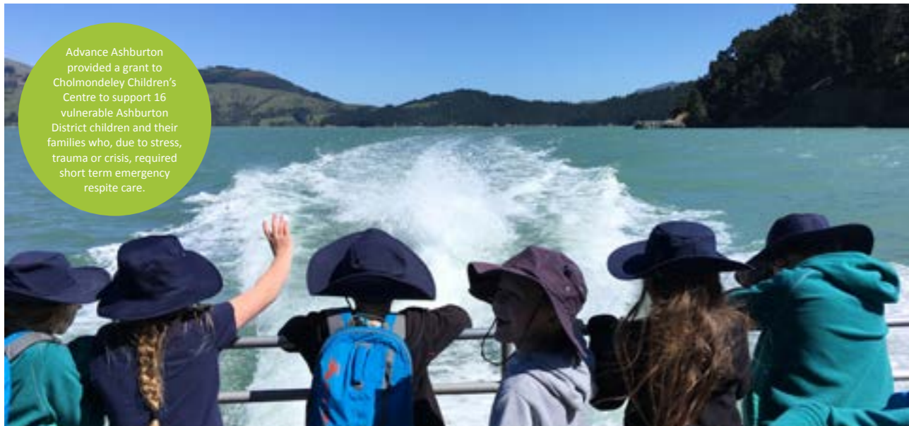
Advance Ashburton provided a grant to Cholmondeley Children's Centre to support 16 vulnerable Ashburton District children and their families who, due to stress, trauma or crisis, required short term emergency respite care.