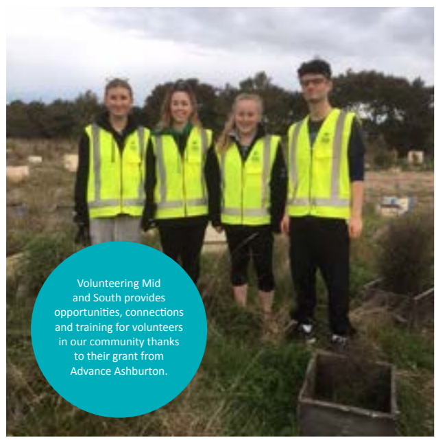
Volunteering Mid and South provides opportunities, connections and training for volunteers in our community thanks to their grant from Advance Ashburton.