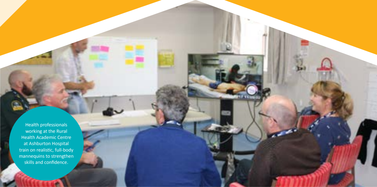
Health professionals working at the Rural Health Academic Centre at Ashburton Hospital train on realistic, full-body mannequins to strengthen skills and confidence.