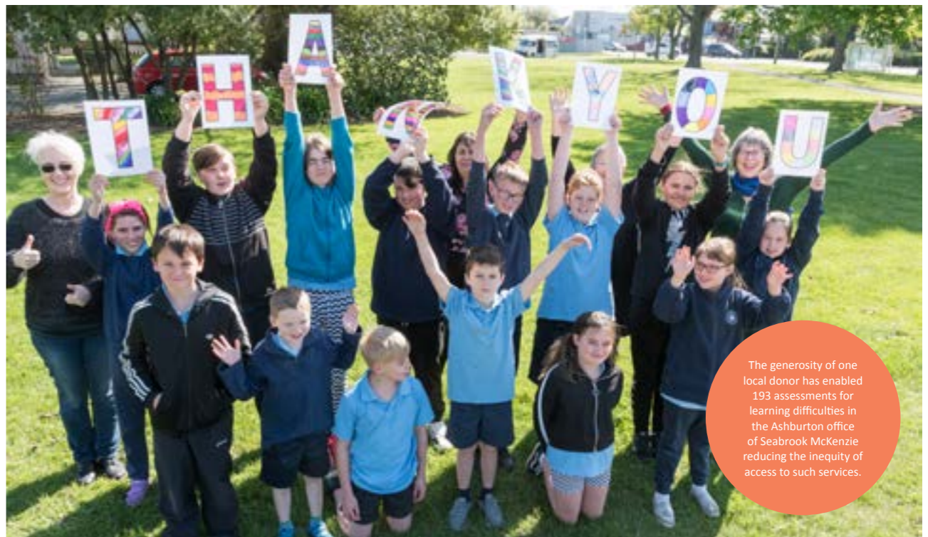
The generosity of one local donor has enabled 193 assessments for learning difficulties in the Ashburton office of Seabrook McKenzie reducing the inequity of access to such services.