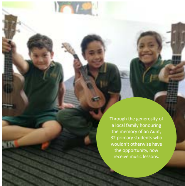
Through the generosity of a local family honouring the memory of an Aunt, 32 primary students who wouldn't otherwise have the opportunity, now receive music lessons.