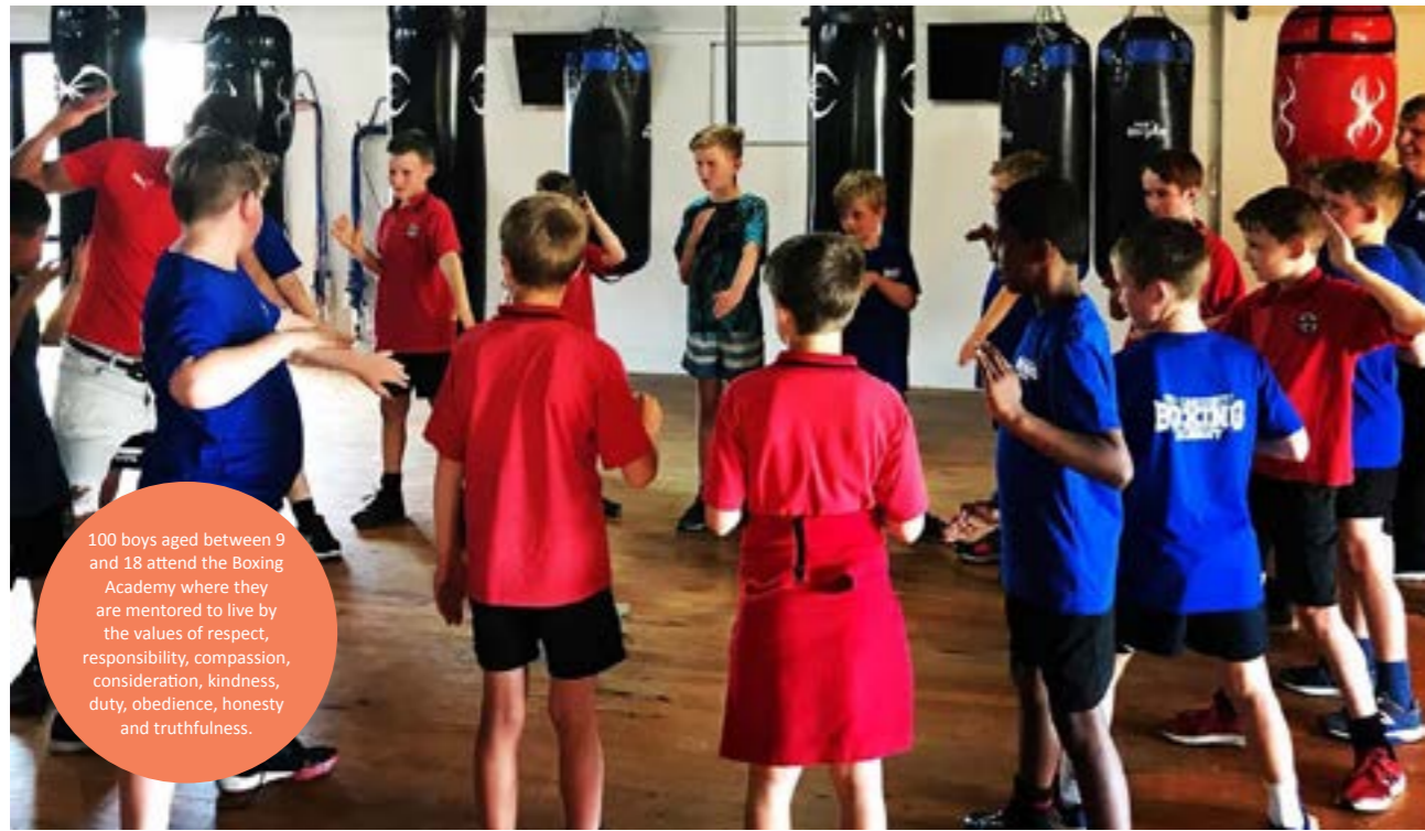
100 boys aged between 9 and 18 attend the Boxing Academy where they are mentored to live by the values of respect, responsibility, compassion, consideration, kindness, duty, obedience, honesty and truthfulness.