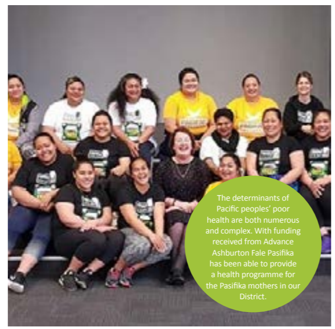
The determinants of Pacific peoples' poor health are both numerous and complex. With funding received from Advance Ashburton Fale Pasifika has been able to provide a health programme for the Pasifika mothers in our District.