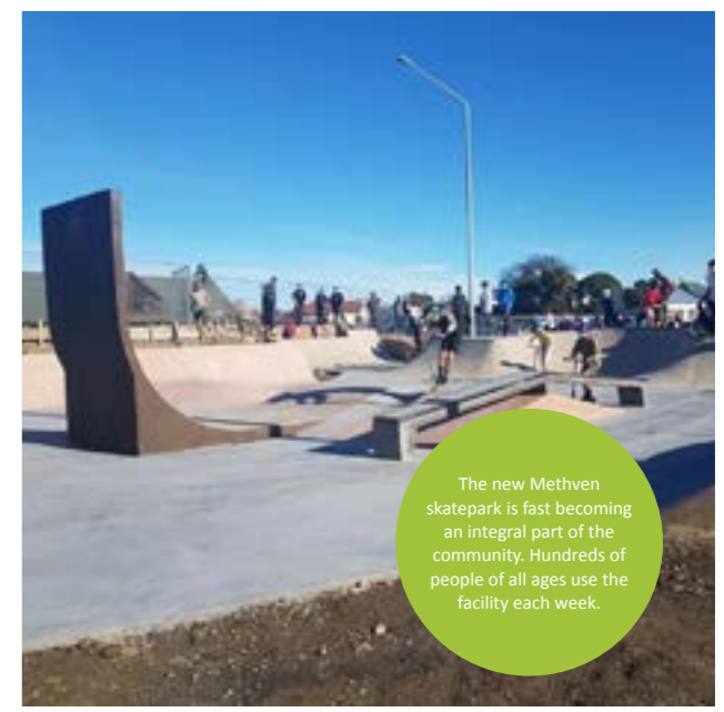
The new Methven skatepark is fast becoming an integral part of the community. Hundreds of people of all ages use the facility each week.