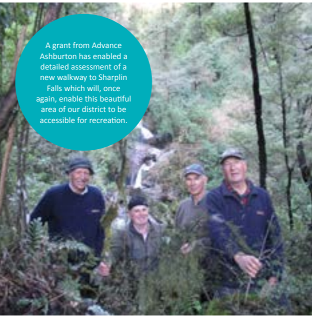
A grant from Advance Ashburton has enabled a detailed assessment of a new walkway to Sharplin Falls which will, once again, enable this beautiful area of our district to be accessible for recreation.