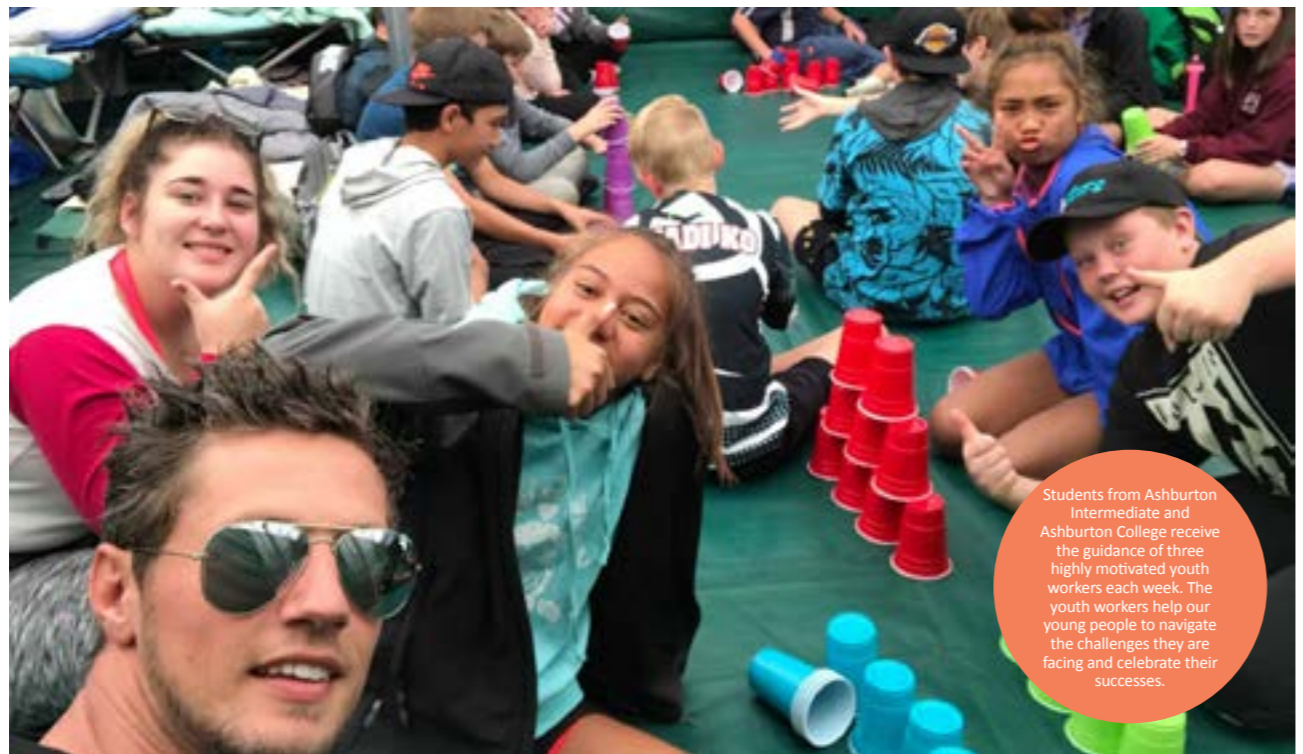
Students from Ashburton Intermediate and Ashburton College receive the guidance of three highly motivated youth workers each week. The youth workers help our young people to navigate the challenges they are facing and celebrate their successes.