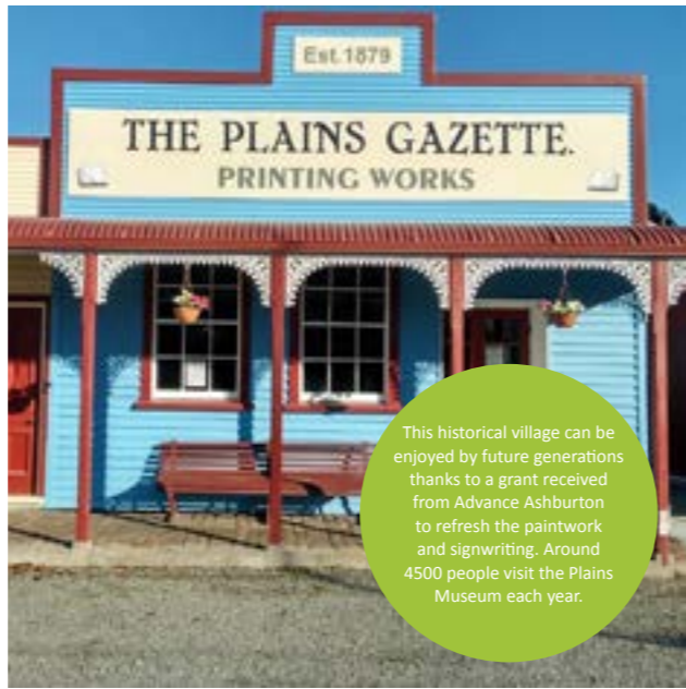
This historical village can be enjoyed by future generations thanks to a grant received from Advance Ashburton to refresh the paintwork and signwriting. Around 4500 people visit the Plains Museum each year.