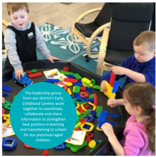
The leadership group from our district's Early Childhood Centres work together to coordinate, collaborate and share information to strengthen best practice in learning and transitioning to school for our preschool aged children.