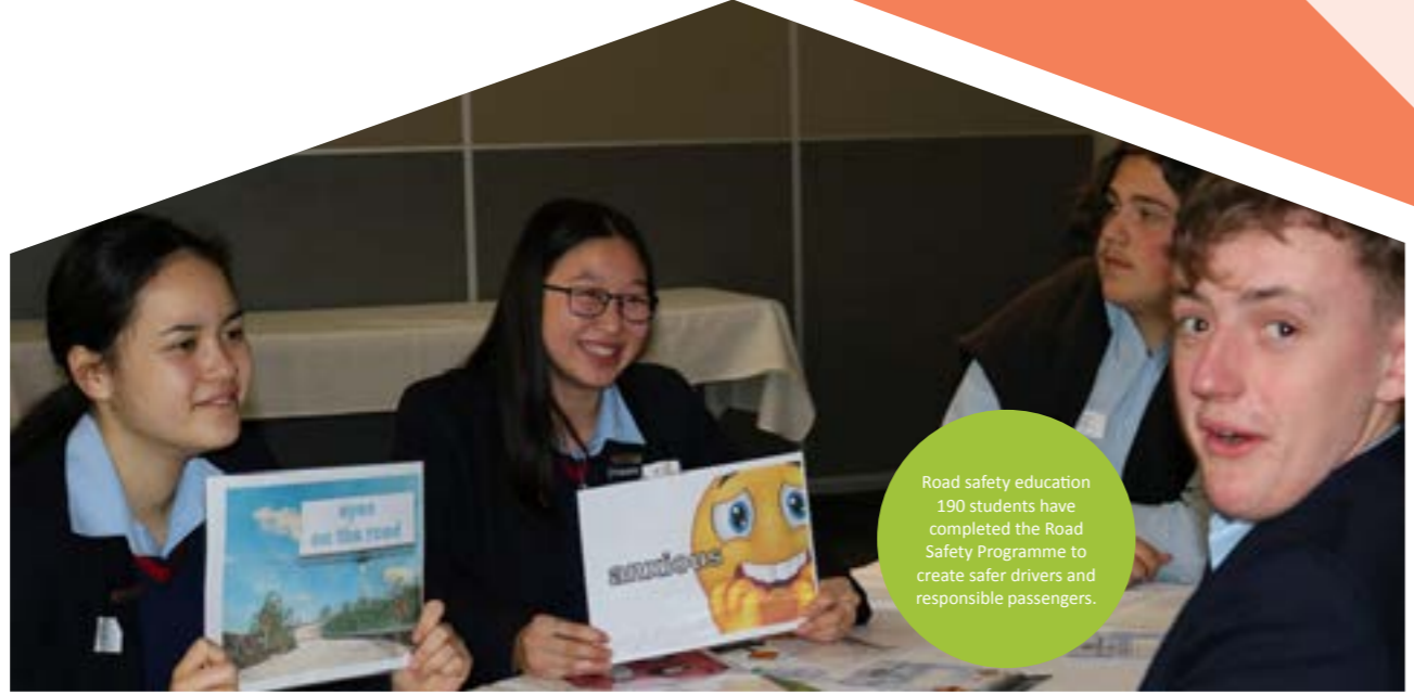
Road safety education 190 students have completed the Road Safety Programme to create safer drivers and responsible passengers.