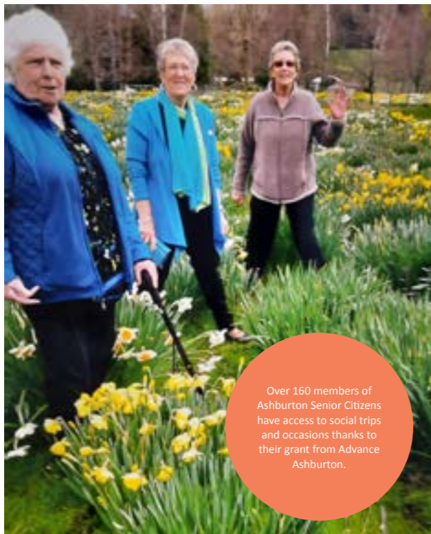
Over 160 members of Ashburton Senior Citizens have access to social trips and occasions thanks to their grant from Advance Ashburton.