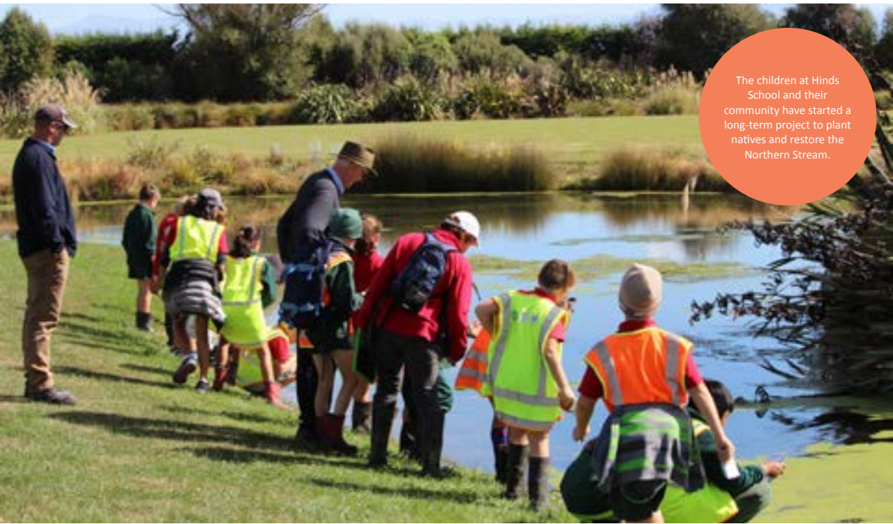
The children at Hinds School and their community have started a long-term project to plant natives and restore the Northern Stream.