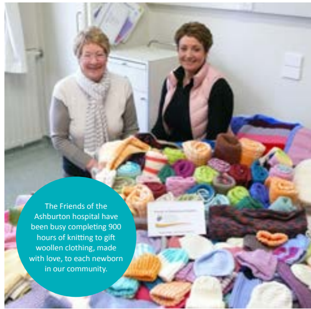
The Friends of the Ashburton hospital have been busy completing 900 hours of knitting to gift woollen clothing, made with love, to each newborn in our community.