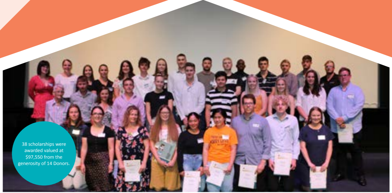
38 scholarships were awarded valued at $97,550 from the generosity of 14 Donors.