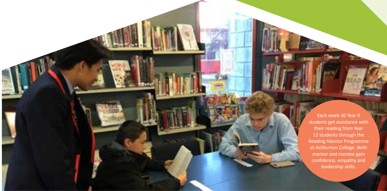
Each week 30 Year 9 students get assistance with their reading from Year 12 students through the Reading Mentor Programme at Ashburton College. Both mentor and mentee gain confidence, empathy and leadership skills.