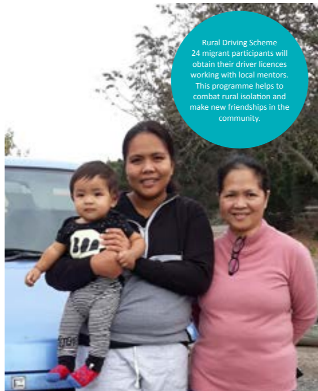
Rural Driving Scheme 24 migrant participants will obtain their driver licences working with local mentors. This programme helps to combat rural isolation and make new friendships in the community.