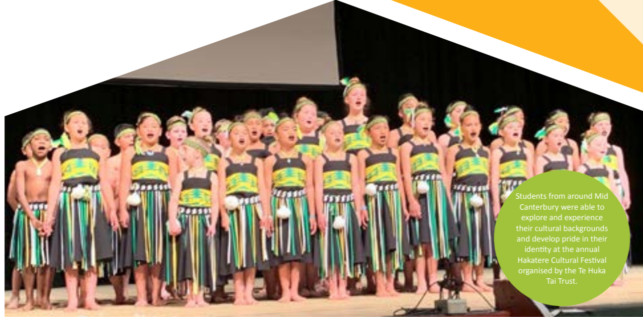
Students from around Mid Canterbury were able to explore and experience their cultural backgrounds and develop pride in their identity at the annual Hakatere Cultural Festival organised by the Te Huka Tai Trust.