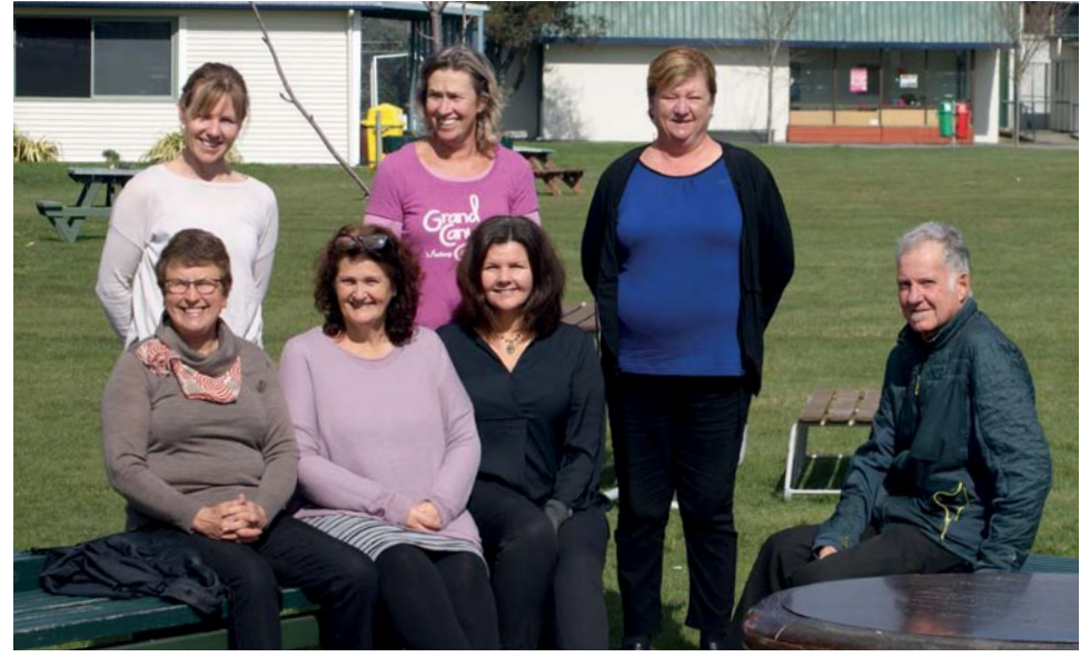
ABOVE The youth mentor, Trustees of the Te Puawaitanga Charitable Trust and a representative of Presbyterian Support.

Sometimes kids need extra help, and they don't always want to talk to a parent or teacher about the issues they are facing. The existence of a Youth Mentor at school, who is approachable and available during school hours, provides an alternative safe place where students can seek help.